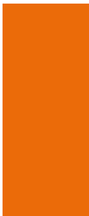
European chemical industry's public image

However, chemical products can have many benefits, and are used in a wide range of everyday consumer products. This is why ChemSec believes that sustainable investors should not exclude the chemical sector as a whole, but analyse the companies differently than today. Besides safety and management strategies, the product portfolio of chemical manufacturers also needs to be evaluated. Some chemical producers are starting to take on the challenge of moving away from hazardous chemicals, so there are opportunities for investors to grasp.